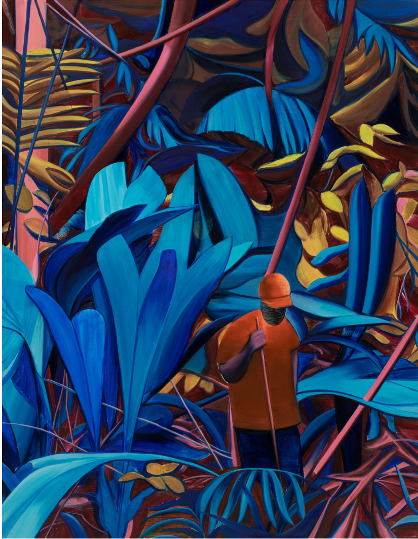
祁磊 Qi Lei 孤独的权杖 Lonely Sceptre 布面油画 Oil on canvas 180 x 140 cm 2022