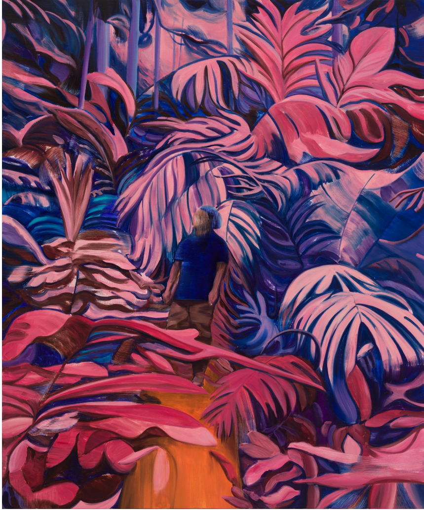
祁磊 Qi Lei 迷失的季节 Lost Season 布面油画 Oil on canvas 158 x 131 cm 2022